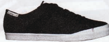
quiksilver capri low, $65