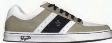
original penguin jingle, $95