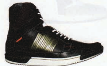
i shoes, $200