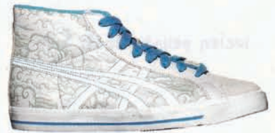
onitsuka tiger, $80