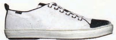
camper twins, $140