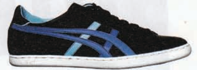
onitsuka tiger, $75