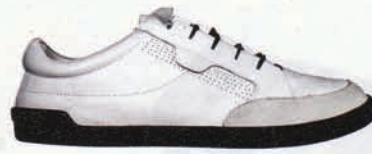
adidas sivr, $165