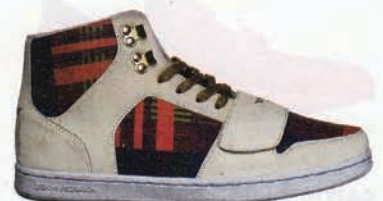
creative recreation cesario, $95