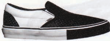
vans classic slip-on lx, $65