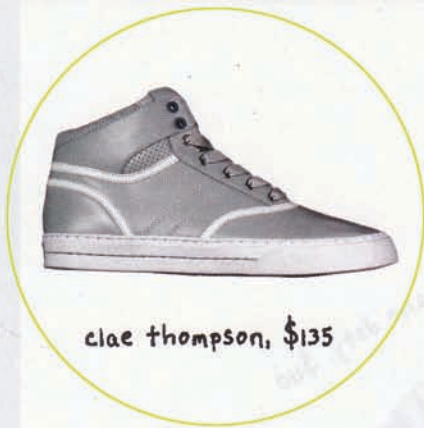
clae thompson, $135